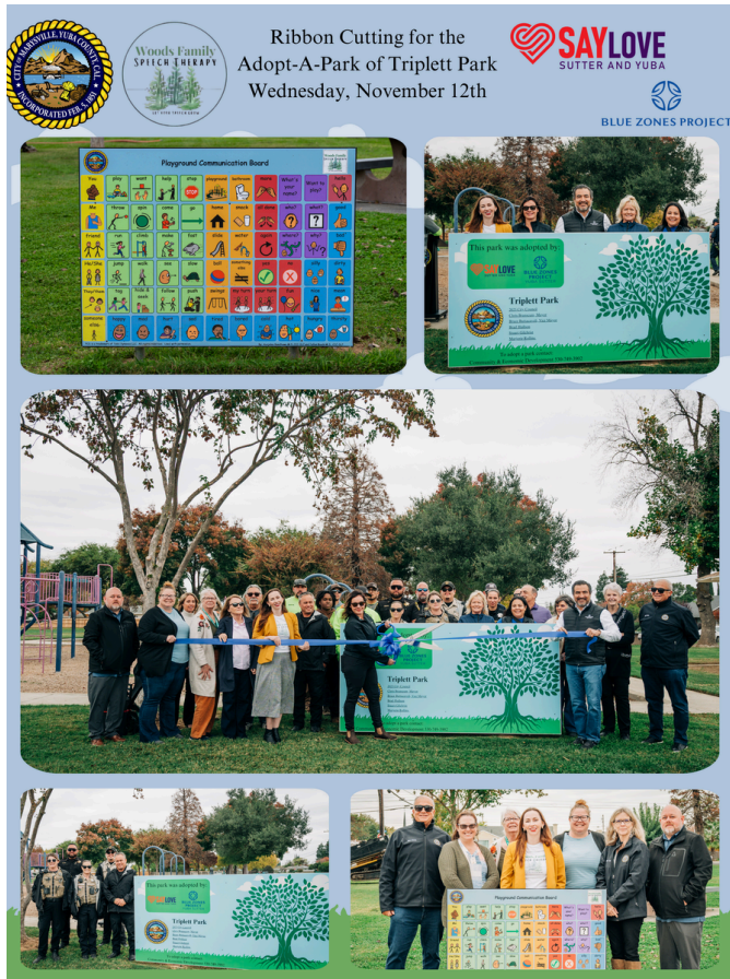
Adoption of Triplet Park & a wonderful Communication Board

A heartfelt thank you to SayLove, Blue Zones, and Woods Family Speech Therapy for their incredible support through the Adopt-a-Park program. Their collaboration made it possible to install a new communication board, creating a more inclusive and welcoming space for all members of our community. We are grateful for their commitment to enhancing accessibility and connection in our parks.